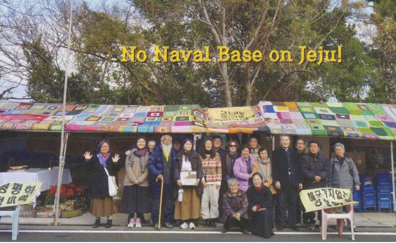
A postcard from Gangjeong Village, Jeju