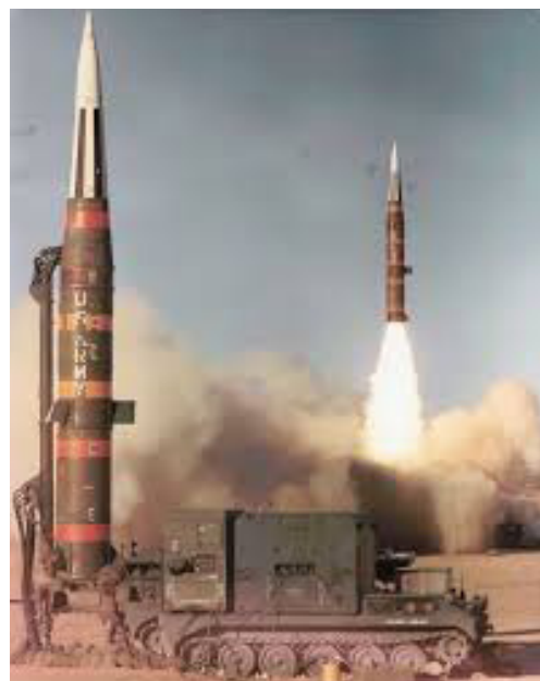
Firing the Pershing missile https://en.wikipedia.org/wiki/MGM-31_Pershing

If nuclear weapons are the problem, then the US should be encouraging (not discouraging) states to sign the Treaty on the Prohibition of Nuclear Weapons. In 1986, at the height of the Cold War, Presidents Reagan and Gorbachev met in Reykjavik and eventually agreed to scrap thousands of intermediate- and short-range nuclear weapons [the 1987 Intermediate-range Nuclear Forces treaty (INF) with Russia]. This meeting