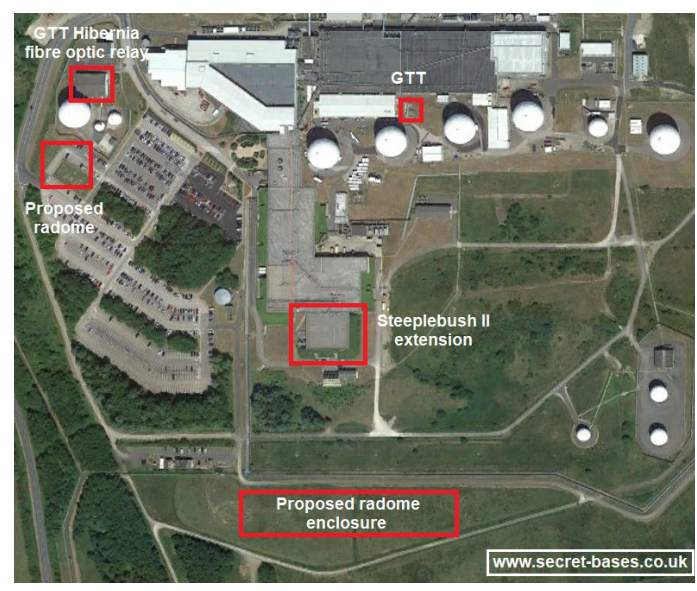
NSA/NRO Menwith Hill proposed new radomes and GTT Hibernia fibre optic equipment.

The new radomes will be 21m in diameter (and 21m high, equivalent to seven-storey buildings and similar in size to other radomes on the site). Like the radome for which construction was approved last year, they will be sited just beyond the built-up area of the base, on grassland. A new 'support building' and the extension of the road network are also involved.