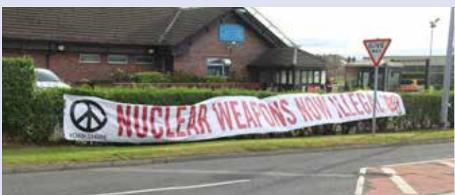
highlight the presence of nuclear weapons stationed across the continent. CND encouraged action at nuclear sites across the UK on 26 September, the International

Day for the Total Elimination of Nuclear Weapons.