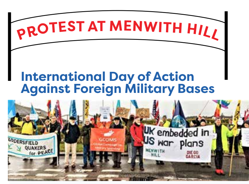
International Day of Action Against Foreign Military Bases

https://www.youtube.com/ watch?v=8HScLY93Aas