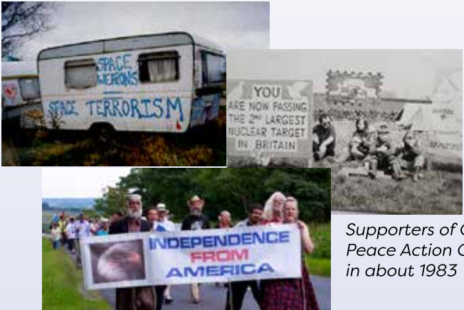
Supporters of Otley Peace Action Group

The Menwith Hill Women's Peace Camp, one of a number of peace camps set up near the base at various times