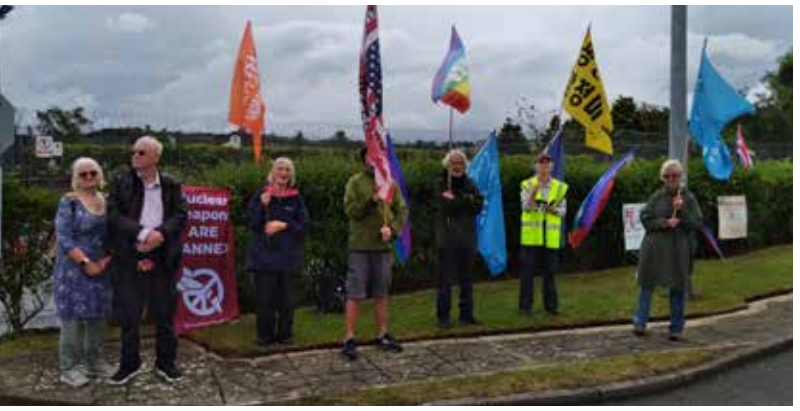
4 July Independence from the USA

The annual 4th July protest (started in the 1980s) included a presence outside Menwith Hill main gate. Thoughtprovoking, interesting speakers in the Zoom webinar included Alex Sobel MP, who continues to ask written parliamentary questions about the base's activities.