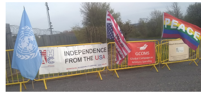
GDAMS at the weekly demonstration

"The United States remains by far the world's biggest military spender. US military spending reached $877 billion in 2022,