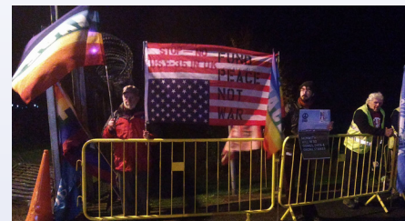
Yorkshire CND at the Tuesday evening protest on 15 November 2022

Because of the major development of the base's main gate area, the main gate is shut. The weekly protest, started by CAAB in 2000, has continued at Nessfield Gate, usually the contractors' entrance.