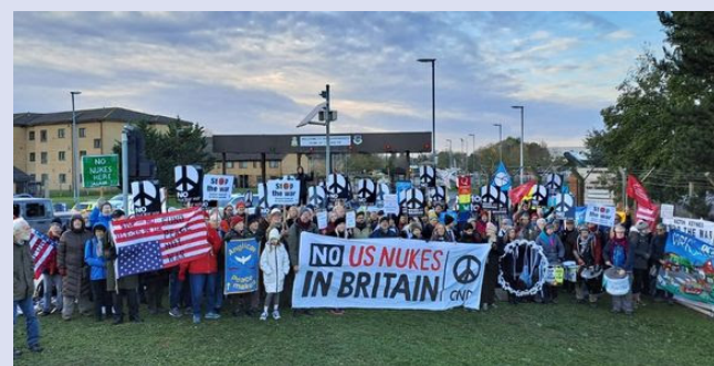
Lakenheath protest

Kate Hudson, General Secretary of CND writes: "the US persists in stationing nuclear weapons across a number of its bases in Europe [including in non-nuclear weapon states] under the auspices of NATO. Its new nuclear bomb, the B61-12, is reportedly scheduled for deployment this spring. Airbases recently upgraded to store the B61-12 include [USAF] Lakenheath in Suffolk.