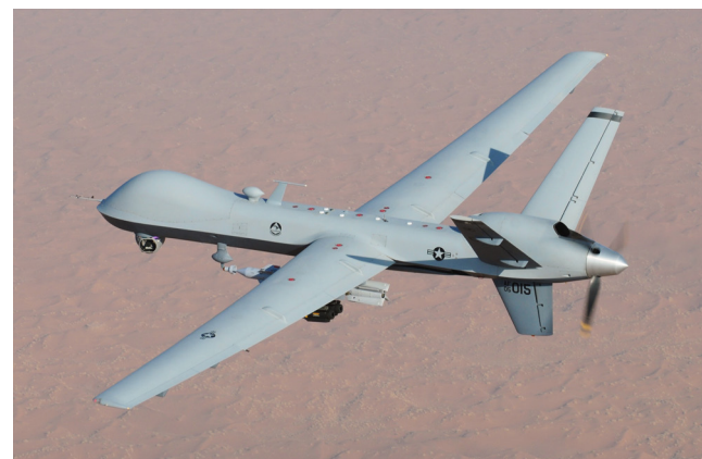
Reaper MQ-9

Documents leaked by the NSA whistleblower Edward Snowden in 2013 confirmed that Menwith Hill was directly involved in the planning of targeted US drone strikes in Yemen, Syria, Pakistan and Afghanistan. USAF Molesworth near Cambridge also hosts personnel involved in US armed interventions in Africa (AFRICOM).