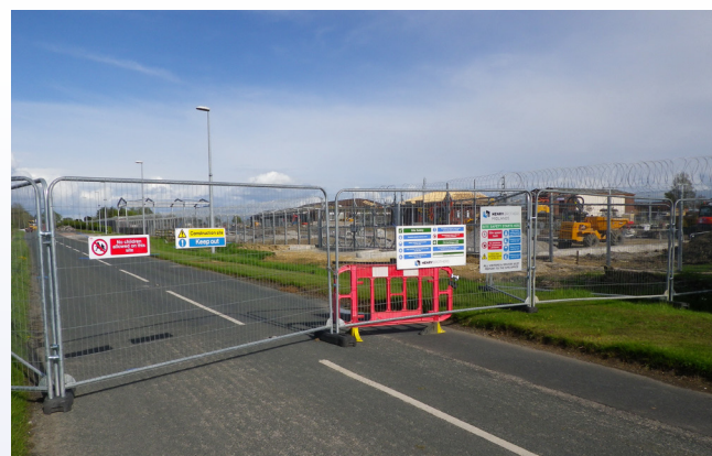
Development at Menwith Hill The development of the main gate area at Menwith Hill which involves the closure for twelve weeks of Menwith Hill Road

A space arms race is accelerating as nations jostle to protect their space assets and compete for space in space. US arms sales have surged including requests for the US Space Force to export satellites and other capabilities. 1 The US Space Force has asked for its biggest budget ever. 2 What costs here for budgets for dealing fairly with the effects of climate change? What costs for the environment from the production and use of all this hardware, even from rocket launches? Expensive developments continue at NSA/NRO Menwith Hill. 3