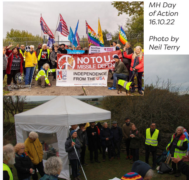
MH Day of Action 16.10.22